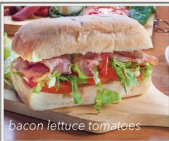
bacon lettuce tomatoes