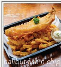
halibut fish n chips