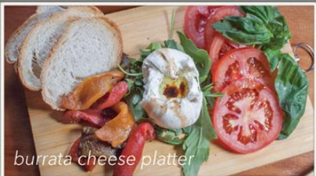
burrata cheese platter