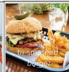
trr's smashed burger